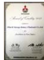
Excellence in Zero Defect